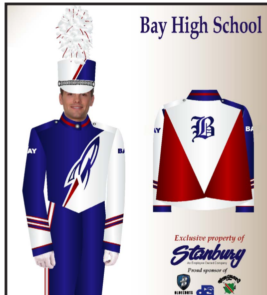
BHS Band Uniform and Rocket Design Prototype

~ Again in 2011, Bay Village has been named as One of the "Best Music Communities in America" This is the 9th year in a row!