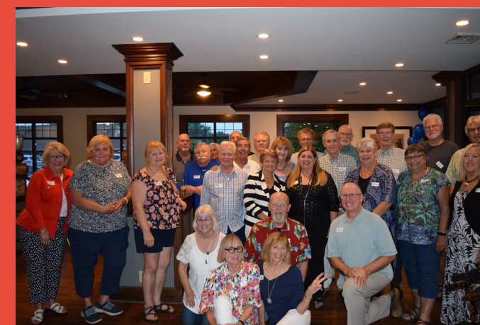
Class of 1968, 55th Reunion