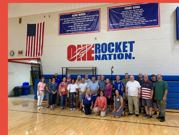
Class of 1978, 45th Reunion